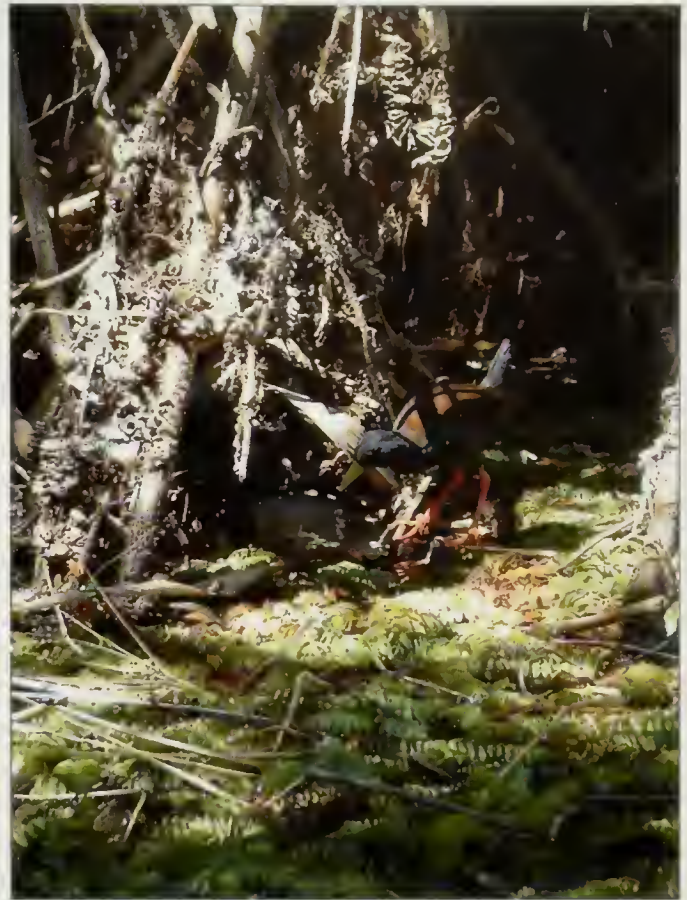
Figure 2. Adult Sakalava Rail / Râle d'Olivier adulte Amaurornis olivieri , Lac Ampandra, Madagascar, November 2002